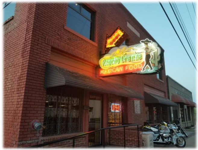
Upper right – Delicious Rancho Grande on Saturday night.