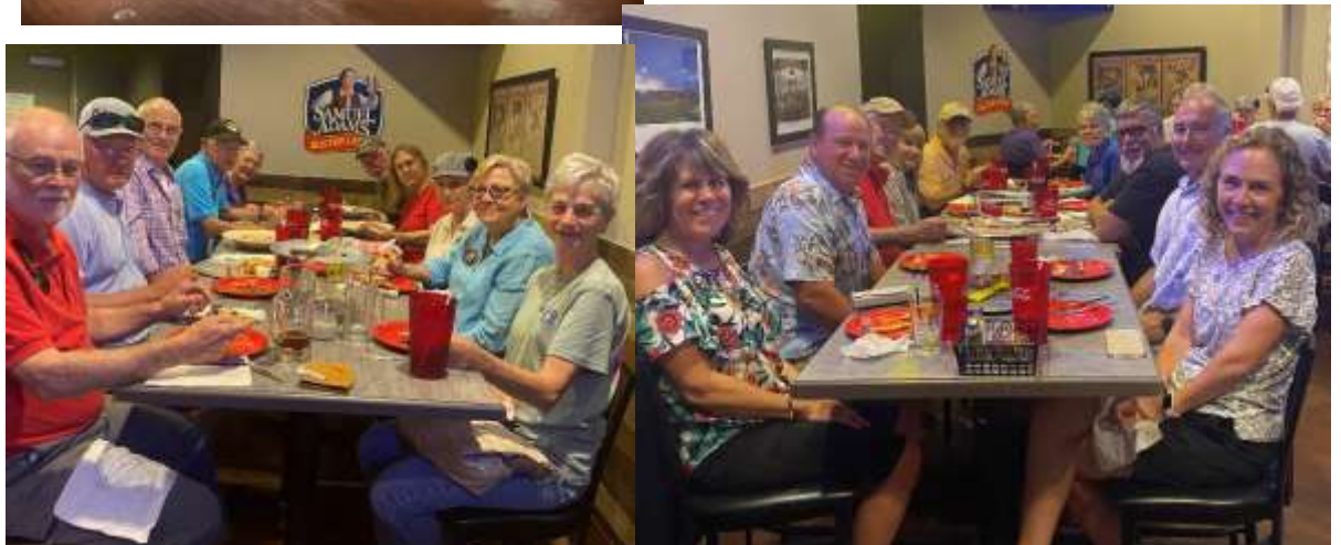
Pizza Dinner at Gusano's

The Daisy Air Gun Museum was on the list for the day for those who were interested in reliving their childhood BB gun days.