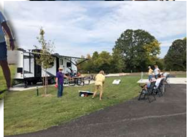
Dinner at Catfish Hole